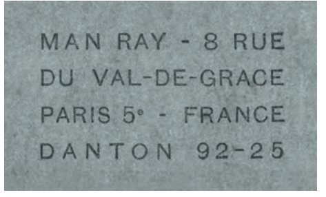
FIGURE 4A. Fake Man Ray stamp, giving the address of Man Ray's Val de Grâce studio, found on the verso of Figure 3.

FIGURE 4B. Wet stamp detail of an authentic Man Ray stamp giving the address of his Val de Grâce studio. This stamp was in use from mid 1935 to mid 1937. Fraudulent versions of the stamp are known.