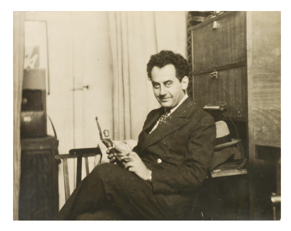
FIGURE 16. Print wrongly said to be a Man Ray Auto-portrait (Self Portrait) , circa 1927 (negative), 22.8 x 29.1 cm (9 x 11 7/16 in.). The location of the sitting is Man Ray's studio at 31 bis, rue Campagne Première.

The studio process would have entailed an assistant retouching the print. This photograph does not reflect the working methods and standards of Man Ray's studio.