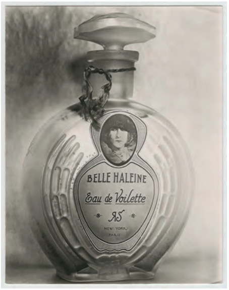
FIGURE 19. Authentic Man Ray photograph, Belle Haleine, Eau de Voilette , 1921 (negative), 11.4 x 8.9 cm (4 ½ x 3½ in.). This is Man Ray's photograph of Marcel Duchamp's Belle Haleine , an assisted readymade, which incorporates a small photograph of Rrose Sélavy. © Man Ray 2015 Trust / ARS, NY / ADAGP, Paris.

It is troubling that a questionable print of Rrose has been circulating at least since 1992, when it was offered in an October 29 Christie's London Photographs auction (Lot 104). The catalogue entry said it was printed ca. 1936-40. I first saw the print in person in Paris late in 2011. The rust orange color of the print concerned me. In 2012, I saw it again