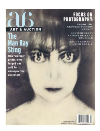
FIGURE 1. Cover, Art & Auction, February 1998, illustrating a fraudulent Man Ray image of La Marquise Casati.

(1930-32), remain unique, transgressive,