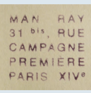
FIGURE 14. Wet stamp, detail of another weak imitation after the Treillard stamp