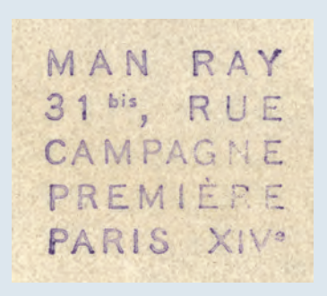
FIGURE 13. Wet stamp, detail of a third fraudulent rue Campagne Première studio stamp; copied from the Treillard stamp.

FIGURE 12. Wet stamp, detail of a second fraudulent rue Campagne Première studio stamp, created by Lucien Treillard after the artist's death. (See: Manford M28; Behind the Photo , 2009.)