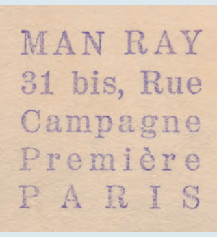
FIGURE 11. Wet stamp, detail of a fraudulent rue Campagne Première studio stamp, found on the verso of Figure 2.