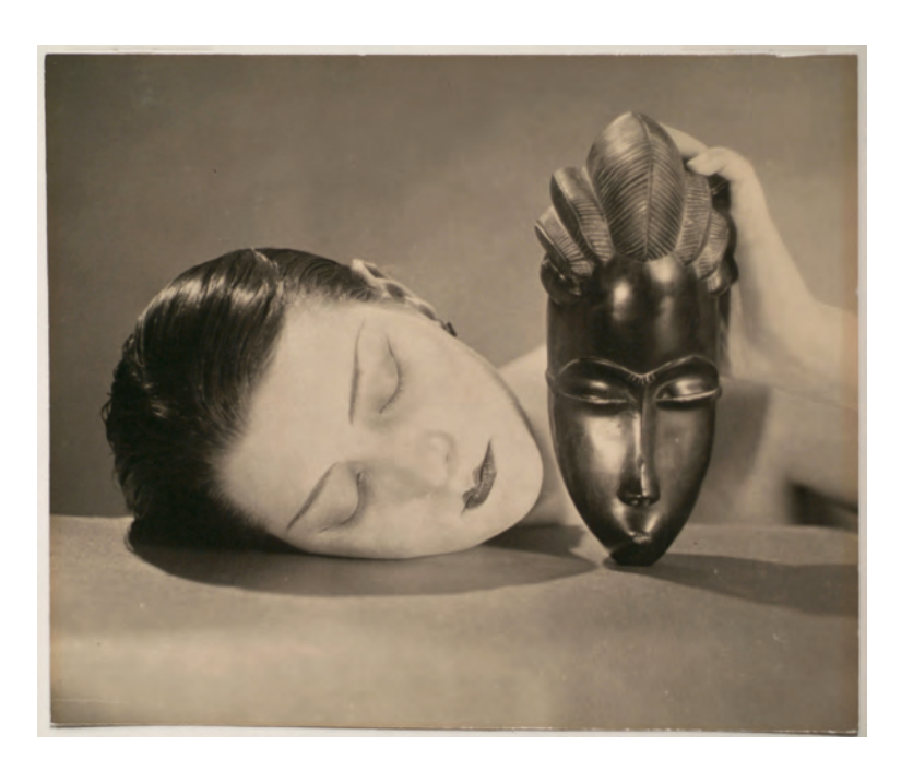
FIGURE 20. A problematic print of Noire et blanche , 1926 (negative), 17.5 x 21.0 cm (6 % x 8 ¼ in.), represented when sold as a Man Ray photograph "probably" printed in the 1960s. The work is not characteristic of a 1960s Man Ray print.