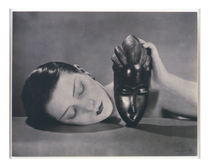
FIGURE 23. Authentic Man Ray photograph, Noire et blanche , 1926/1927 (camera original negative and retouched negatives), printed between 1927 and 1930, 21.6 x 26.0 cm (8 ½ x 10 ¼ in.), Private Collection, New York.

"working negatives" of the Noire et blanche created by Man Ray. These were used in the making of some of the prints.