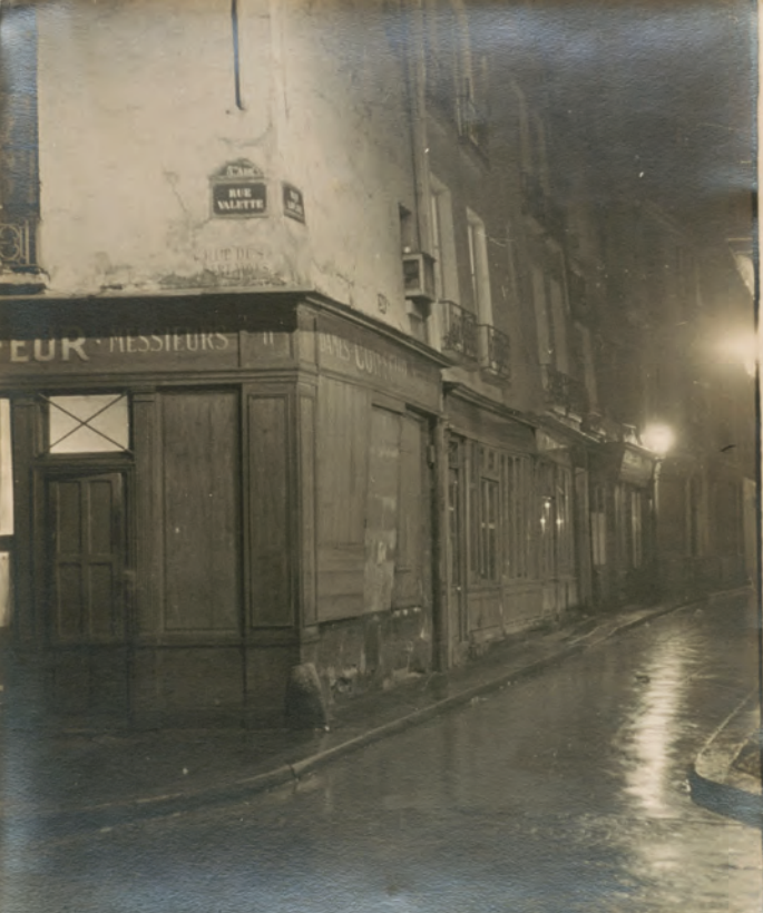
FIGURE 3. Unknown photographer (formerly represented as by Man Ray), Paris Street Corner (Rue Valette and Rue Laplace) , undated, 29.8 x 24.1 cm (11 <sup>3</sup>/<sub>4</sub> x 9 <sup>1</sup>/<sub>2</sub> in.).

Another interesting fake is this large photograph of a Paris street corner at night after rainfall (FIG. 3). Based on the silvering in the shadow areas, it is of some age. Although untitled and undated, the street names are pictured. It is the corner of rue Valette and rue Laplace on the Left Bank. On the verso, in the bottom right corner, is a wet stamp impression with the name Man Ray and the Paris studio address of Val-de-Grâce (FIG. 4A). At the bottom left is an inventory number. There is little information attached to this work. In the same collection is a companion print of another Paris street, with the same studio stamp, and an inventory number, in the same hand. Those numbers suggest that the works were in a dealer's inventory in 1989.