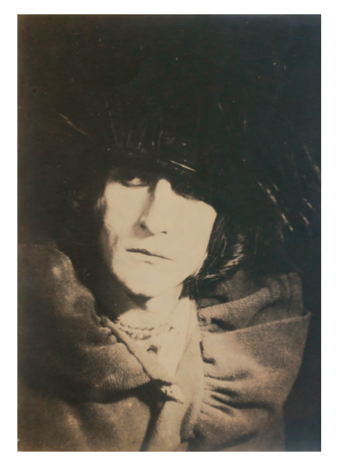
FIGURE 18. Fake Man Ray Rrose Sélavy , 1921 (negative), 22.0 x 17.6 cm (8 % x 6 % in.). This photograph shows Marcel Duchamp in the guise of his feminine alter-ego Rrose Sélavy.

Where did the forger, and where did the buyer, make mistakes? First, was the printing of an image that Man Ray himself had never printed. Where a period print exists, it serves as a guide for the forger, to mimic the artist's eye and the hand. In this instance, however, all that the forger had to work with was a negative, which represented only what the camera recorded. The print lacked the interpretation and the voice that a good photographer brings to the medium and the print. The buyer was lured in by the surprise of seeing Man Ray looking back at him. The collector had a passion for Man Ray, as did Bokelberg, as did others taken in. That was the problem. There was little space or time to reason through the photographs, to consider the elements that make up the object, which, in the end, did not add up.