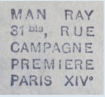
FIGURE 10. Wet stamp, detail of an authentic Man Ray rue Campagne Première studio stamp. (See: Manford M6; Behind the Photo , 2009.)