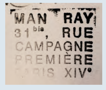
FIGURE 15. Wet stamp, detail of a fifth fraudulent rue Campagne Première studio stamp, which is found on a number of problematic photographs, including works enhanced using imaging software.

inconsistent with his desired image, and it was a weak composition. Rather than being an Autoportrait , my opinion was that the creation of the negative was for personal use only.