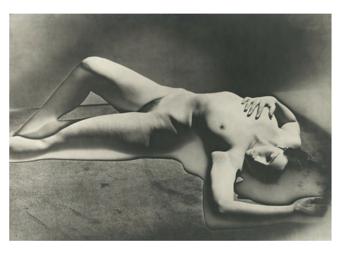
FIGURE 7. Purported Man Ray, Primacy of Matter over Mind (Primat de la matière sur la pensée) , ca. 1929-32 (negative), printed sometime after the death of Man Ray, 20.6 x 29.2 cm (8 ½ x 11 ½ in.). The photograph was represented by the seller as an early print by Man Ray.