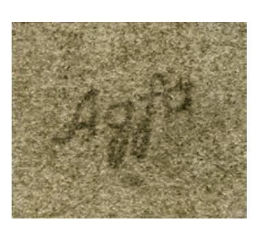
FIGURE 17. A detail of the verso of Figure 16 showing the Agfa photo paper manufacturer's logo. The faint image has been digitally enhanced here.

Also on the print verso is the back printing by the paper manufacturer Agfa (FIG. 19). Agfa paper of recent manufacture was the downfall of the Bokelberg Man Rays. Testing at the Agfa Bayer labs in 1997 confirmed that none of the tested Bokelberg prints could have dated from the 1920s or 1930s. The Eureka moment was short-lived, for the faint logo could easily be sanded off. The difficulty in